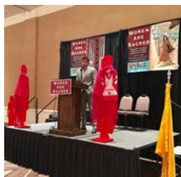
Taylor Sheridan Writer and Director Wind River

Conference attendees were encouraged to wear their traditional clothing on Tuesday to celebrate their culture. On Wednesday, all were encouraged to wear red in remembrance of MMIWG. A local Albuquerque organizing collective of Indigenous Women created an exhibit called “Missing and Murdered Indigenous Women Earring Project” where donated earrings were displayed on a large board. A Powwow was also held to honor