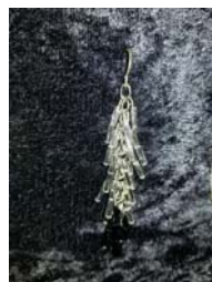
Eagle Feather Earring Donated by the WWC